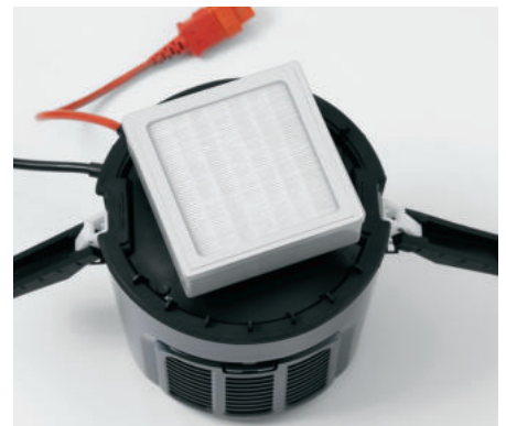
Easy to install optional HEPA filter for allergy & asthma sufferers